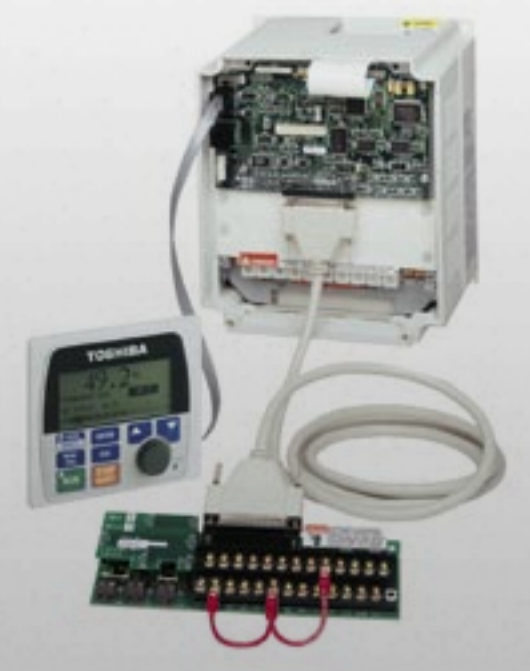
Remote–Mount Interface and Terminal Strip

The removable control terminal strip is available in dry contact, TTL or 120 VAC configurations and may be optionally DIN Rail mounted. The operator interface can be easily mounted remotely and configured for NEMA4/NEMA12 environments.