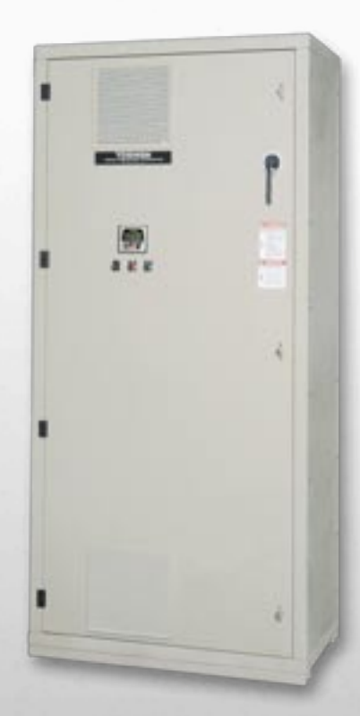
H7 Assembly Unit